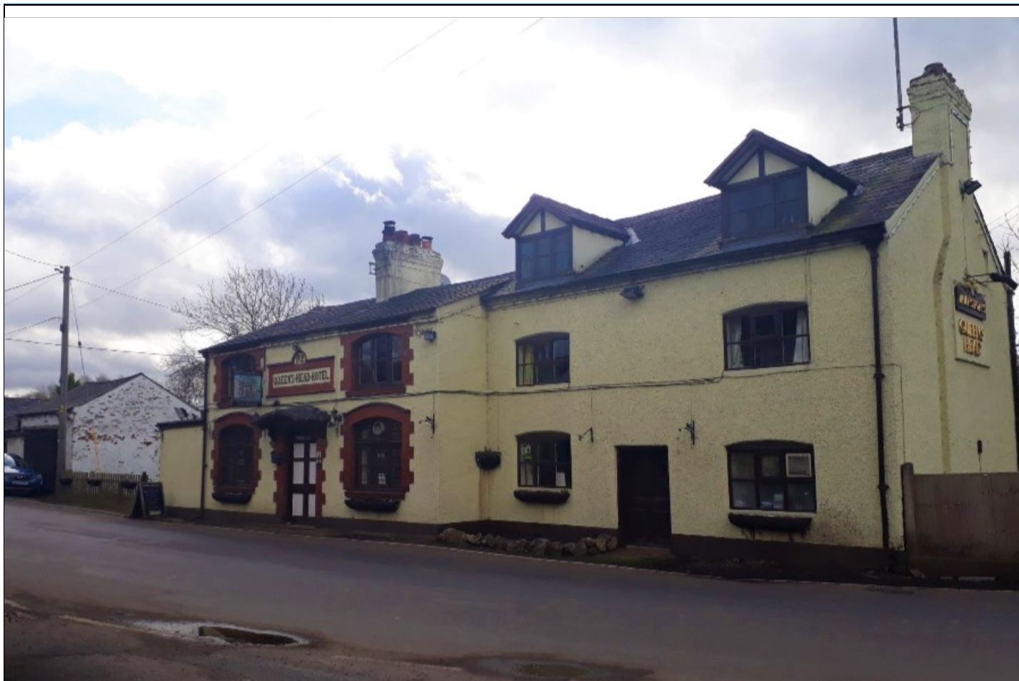
Queens Head, Sarn, Malpas, Cheshire, SY14 7LN

Offers in the Region of £225,000 Excluding VAT